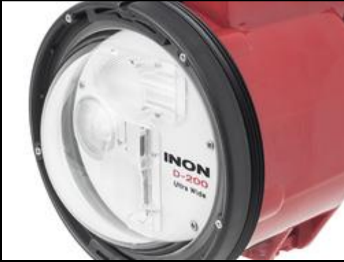
D-200 front dome lens

Furthermore, the D-200 has overcome drawback of high-power strobe which has long flash duration and reaches to FULL power in significantly short period of time after start flashing.