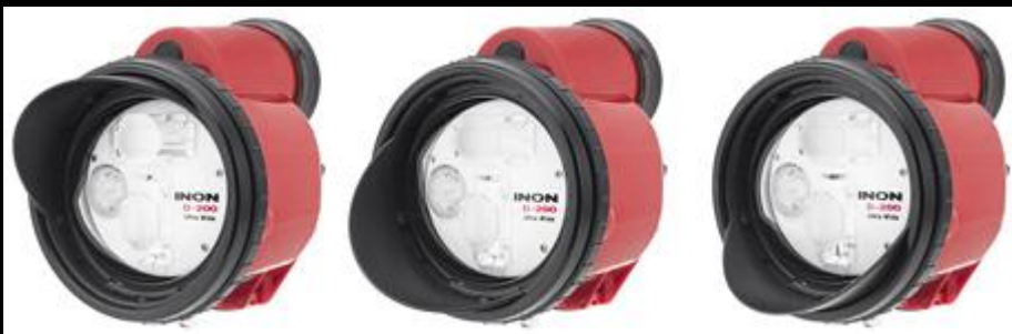
The shade goes to any position.