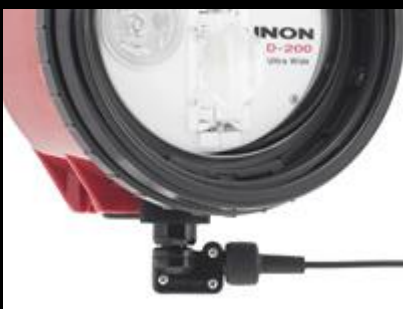
Optical cable connection

The D-200 is equipped with high performance slave sensor to trigger optically by optical triggering signal (i.e. camera's built-in flash).